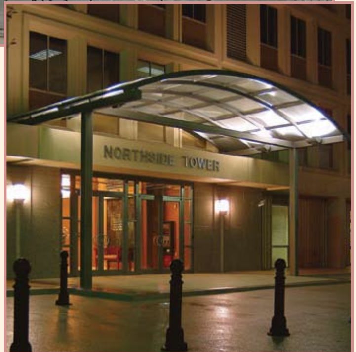
A Sandy Springs Landmark